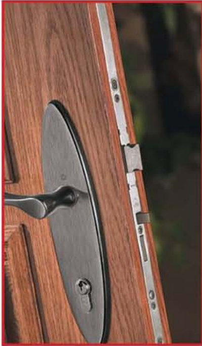
Manual/Tongue Shootbolt Version